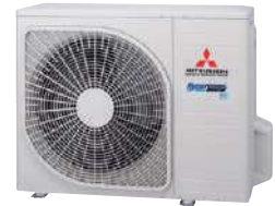
SRC20ZSX-W, SRC25ZSX-W, SRC35ZSX-W, SRC50ZSX-W2, SRC60ZSX-W1