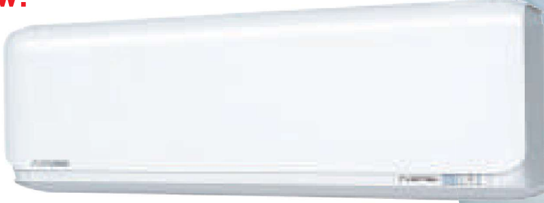
SRK20ZSX-WF, SRK25ZSX-WF, SRK35ZSX-WF, SRK50ZSX-WF, SRK60ZSX-WF Pure White(-WF)